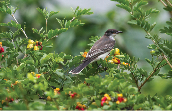
Eastern Kingbird in lignum vitae

Gardening for birds in subtropical South Florida is different than anywhere else in North America; our climate, seasons, plants and birds distinguish our region even within Florida. Because we are warmer and wetter, plants grow fast here and flowers can bloom year-round.